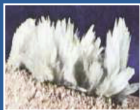
Calcium Carbonate in aragonite form