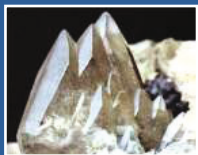
Calcium Carbonate in calcite form

Harmoniser is a physical water treatment device which works on the principle of Flow Dynamics. Water, when passing through the device, is made to flow in a process which results in water gaining turbulence. Silicon Dioxide Quartz Crystals are placed within the device for this purpose. This process breaks the weak bonds between the Calcium and Magnesium ions resulting in a precipitate in the form of Aragonite and not Calcite. The resultant water post treatment retains all the minerals, thus not affecting the TDS or the Hardness & is less viscous with increased wettability properties.